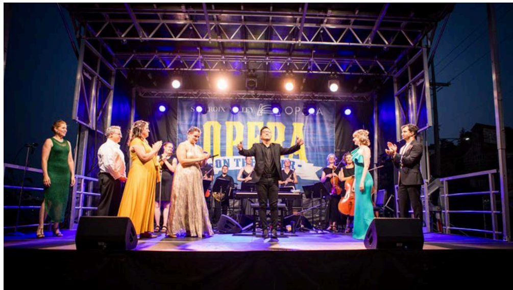
Beautiful Day for Opera on the River 2024