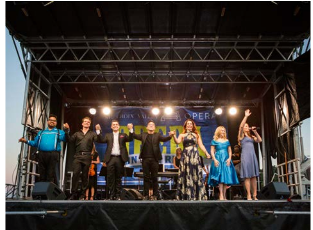
Another Perfect Day for OOTR 2023