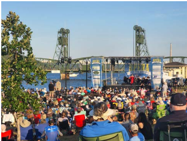
Finally a Perfect Day for OOTR 2022