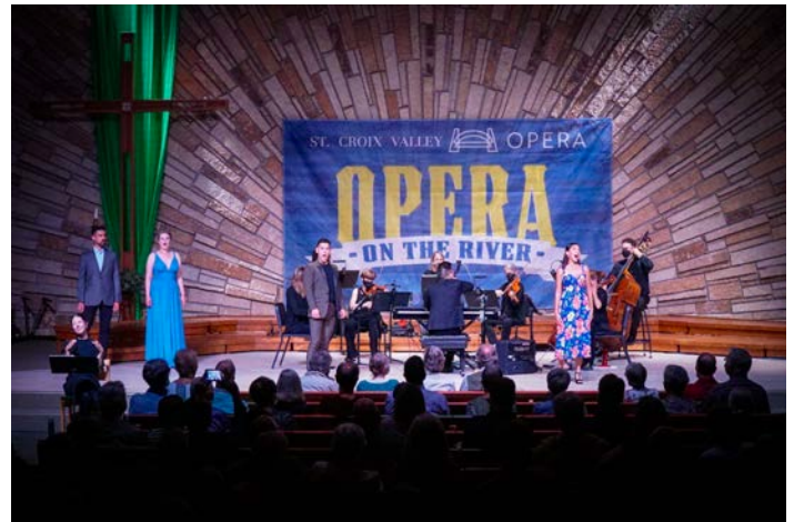
Rain Day in Trinity Lutheran Church 2021