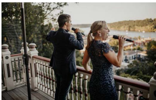
Pandemic Virtual Live Broadcast 2020