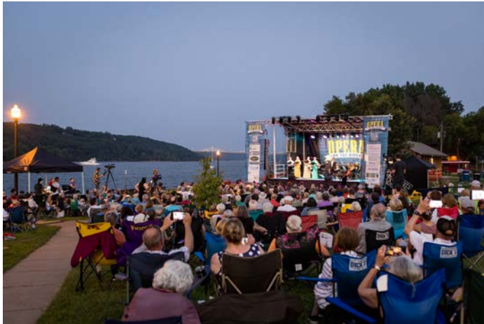
Yet, Another Perfect Day for OOTR 2024